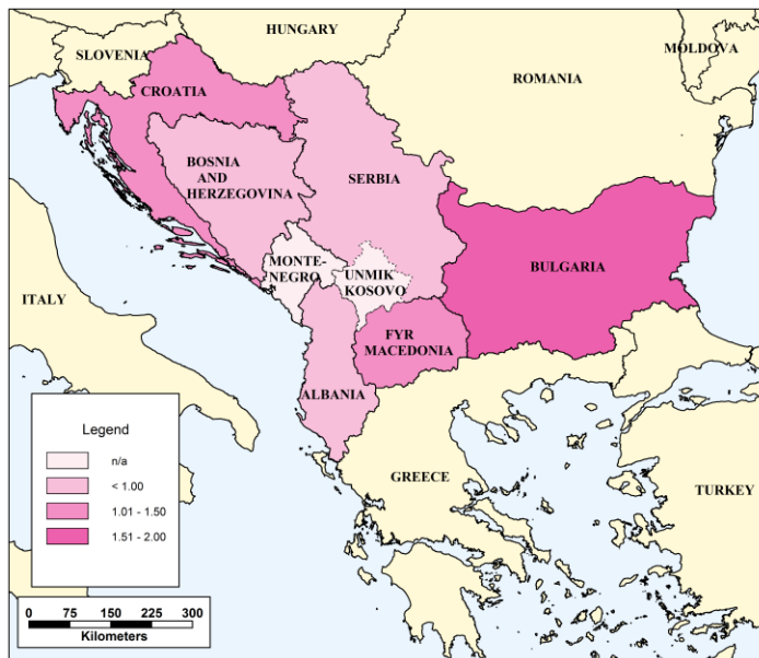
Figure 1 Inward FDI Performance Index ( I_1 ) in SEE countries in 2000

With time, inflow of FDI grew in most SEE countries as well as I_1 , but the fall was recorded for 2004 and between 2008 and 2009. However, instability occurred in some SEE countries in 2004 due to the political changes, which led to decrease in inflow of FDI.