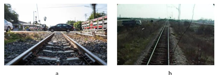
Figure 3 The vehicle in a free profile at the level crossing (a) and moving towards the level crossing at high speed (b)

For these reasons, it is necessary that the ODS can monitor and classify obstacles, at least at the level that the train drivers can achieve. This is not an easy task, especially in the case of moving obstacles. For successful classification of obstacles, it is necessary to determine several parameters, some of which are not easy to determine. Unlike road traffic, trains have very long stopping distances and this drastically increases the number of possible risk situations. Practically every living being or vehicle that is located at a distance of a kilometre or two (depending on the type of train) near the railway represents a potential danger that must be detected and assessed. Based on a survey with train drivers conducted in Serbia, it can be concluded that they assess the risk of moving obstacles based on distance, position of the obstacle in relation to the free profile, its movement, but also some characteristics of the obstacle itself. In case of humans this assessment can be based even on the so-called body language. At the same time, none of the parameters has an unambiguous influence on the risk assessment. In some cases, a more distant obstacle may be more risky than a closer one.