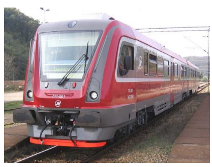
Figure 1 Diesel engine train series 711, equipped with measuring devices

Set of diesel engine train is composed of two motor wagons for passengers, which are attached by clutch. Figure 1.