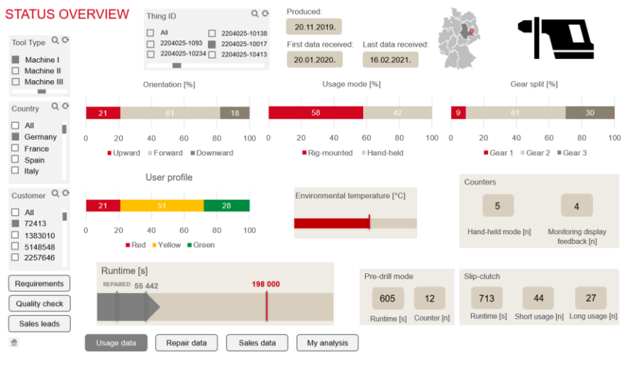
Figure 3 Drilling tool status overview

The sensors embedded in the drilling tool provide environmental data (such as a temperature, current real-world time and date) and usage data (such as motor running time, drilling mechanism usage time, applied pressure, gear usage, slip clutch usage, pre-drill mode usage, orientation). As a part of the pilot study, a mock-up solution of an application for data exploitation and analysis was suggested. An interface showing information that may be extracted from the abovementioned data is presented in Figure 3.