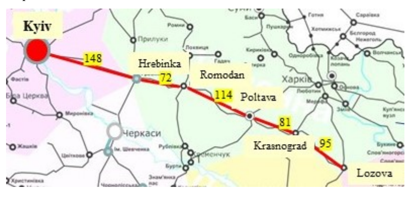
Figure 1 Railway section Kyiv - Lozova

Let us consider an example of calculations using the algorithm presented above for the Kyiv-Hrebinka-Poltava-Lozova route (Ukraine), Fig. 1. The positional layout of the track plan was determined under the condition of route modernization, aiming to achieve the highest possible speed while remaining within the existing embankment. The maximum allowable horizontal displacements of the track (alignment corrections) depend on various factors, such as the track's construction, its condition [33] [34], the presence of infrastructure devices, including power supply systems, signaling systems, etc. [35-40]. Following a thorough terrain analysis, it was stipulated that permissible shifts in the range of 0-250 mm would be acceptable in this scenario.