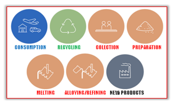
Figure 3 The stream of aluminium waste to recycling into new products

The heart of aluminium recycling is the melting aggregate, in which the waste melting operations are performed in order to obtain new raw materials. Melting is the process by which aluminium scraps can be reused in products after their initial production.