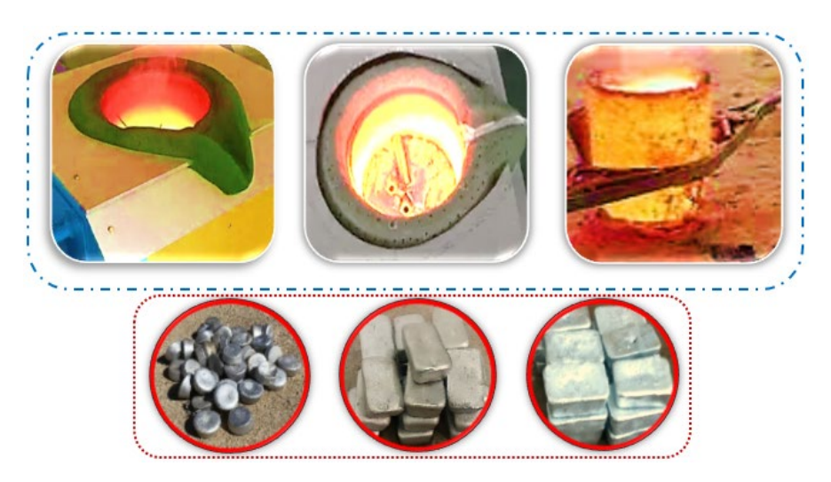
Figure 5 Aluminium scraps melting process and cast ingots

At the moment the aluminium can (Fig. 6a) is one of the most recycled packaging in the world. Many of the food and beverages that we buy every day are packed in aluminium or steel cans, both materials can be recycled in order to manufacture new containers or other metal products. Sooner or later, each can ends up being thrown in the trash, where it begins its journey to recycling. However, many cans end up in landfills. The melted aluminium cans chemical composition in Table 1 is presented.