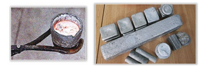
Figure 7 Aluminium scraps: melted aluminium and cast aluminium ingots

The quality of the metal is defined by three characteristics, namely: