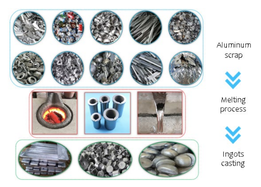
Figure 4 Re-melting the aluminium scrap

The process (Fig. 4) simply involves re-melting metals, which is much less expensive and more energy-intensive than creating a new aluminium by electrolysis of aluminium oxide (Al2O3), which must first be extracted from bauxite ore and then refined using the Bayer process. The selection of the melting furnace is a critical aspect and it depends on the quality and quantity of the scrap.