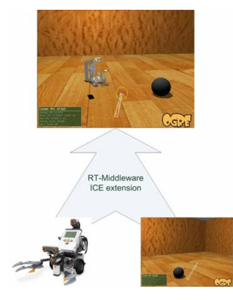
Figure 3 The concept of VIRCA system.

Magyar Kutatók 10. Nemzetközi Szimpóziuma 10<sup>th</sup> International Symposium of Hungarian Researchers on Computational Intelligence and Informatics